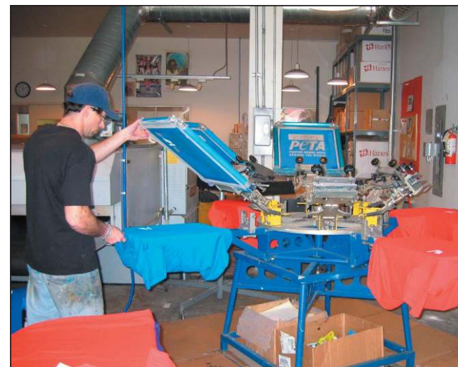
Pictures of Ashbury Images, a local program that trains and employs at-risk people in the screen printing business.

At The Crossroads is a project of the San Francisco Foundation Community Initiative Funds.